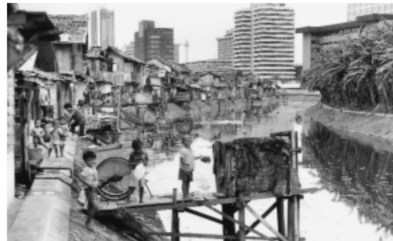
The great divide: the urban poor lack even basic services.

Governance can be defined as the means and processes through which a city government enables the city to fulfil its functions effectively. But what are the functions of a city, large or small, in the 21 st century? The challenge for city governments is to balance a number of very different roles, which put very different demands on the city’s resources.