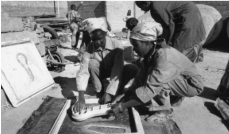
Waste matters: these women in Kamanya, a suburb of Lusaka, are building toilets.

consortium were held by London-based International Water Limited, a subsidiary of the US-based Bechtel Corporation, and by the Italian energy company, Edison. The consortium planned to construct the US$130 million Miscuni Dam to provide water to Cochabamba. But the costs of this dam, which was due for completion in 2007, were immediately factored into water charges.