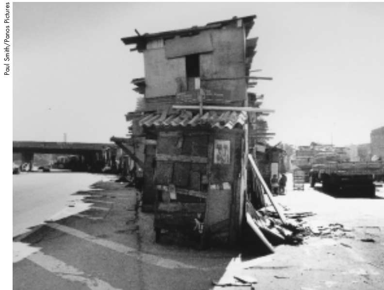
Reach for the sky: a slum area in São Paulo, Brazil.

As the special session of the UN General Assembly meets in New York to consider the successes and failures of the Habitat Agenda (Istanbul + 5) this report assesses what lies behind the rhetoric of empowerment and examines whether these strategies have led to real improvements in people's lives.