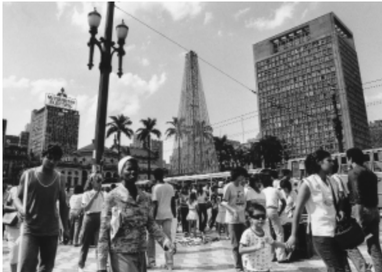
Complex cities: are national and city governments able to rise to the challenges that urban living presents?

considerations. As a result, despite the law, many cities continue to be governed by bureaucrats accountable to the state government and its elected body rather than to an elected local authority.