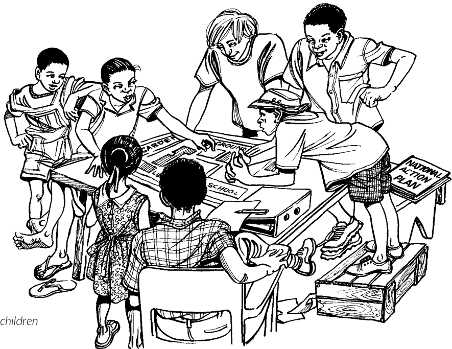
Older and younger children working together.

Third, verbal or written expression is only one of many ways that children can express a viewpoint. In fact, Article 13 of the CRC guarantees children’s freedom to “impart information and ideas” through the media of their choice. As a result, a creative array of tools can and should be used to gather information about children’s viewpoints. Children’s forms of expression include not only oral and written communications, but also art, drama, and music. Facilitating and observing these various forms of expression is especially important when working with children in difficult circumstances, such as OVC, who may be silent, unresponsive, or withdrawn (Tolfree and Woodhouse 1999). In addition, children in some traditional African societies may have unique social spaces through which to communicate with adults, even though it is culturally inappropriate for children to talk to adults in public (Miljeteig 2000).