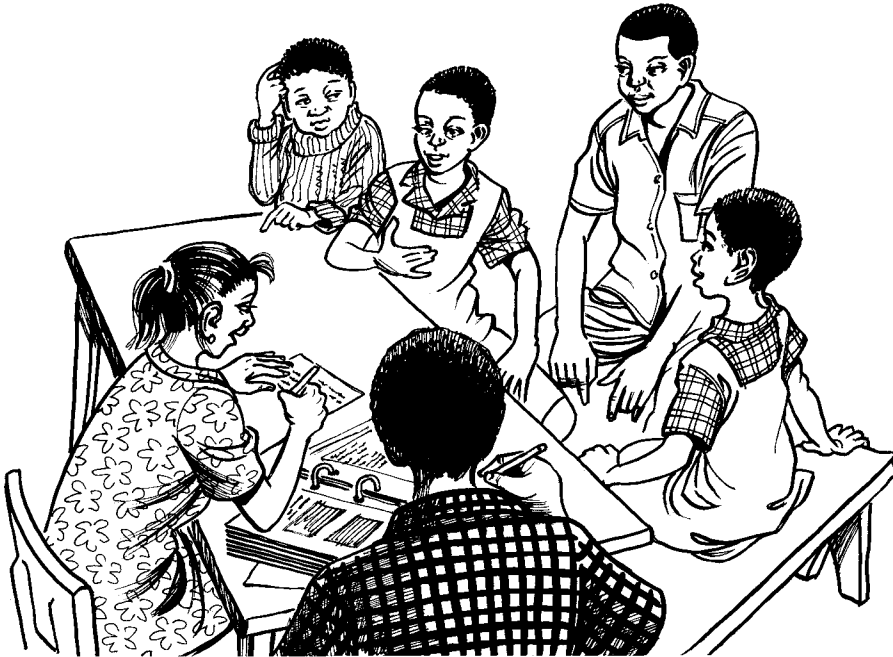
Children giving their feedback to adults.

The Teams meet formally once a month at the school, and stay in contact on an ongoing basis. They rotate chairing the monthly meetings so that every member—including the two children—has an opportunity to serve as chair. These meetings are a time for the peer counselors to discuss their concerns and share the list of counseling “cases” they have addressed the month. At their meetings, the Team also determines, as a group, what actions need to occur. The child members are usually tasked to follow-up with children who are not attending school, while teachers are asked to address school-wide issues such as bullying and the volunteers take on problems that stem from children’s home situations, such as a lack of food.