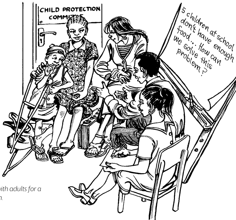
Two children meeting with adults for a problem-solving session.