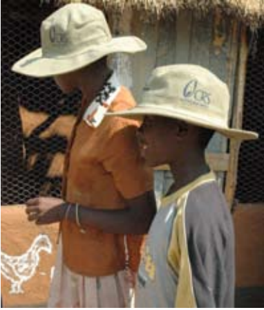
Participants in the Junior Farmer Field School view a poultry project.