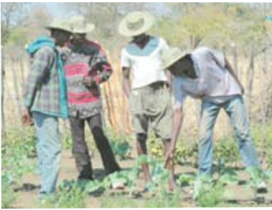
Learning in the field is an important part of the curriculum.