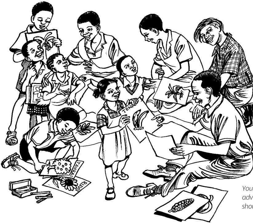
Young children give their advice on what the school garden should grow by drawing pictures.