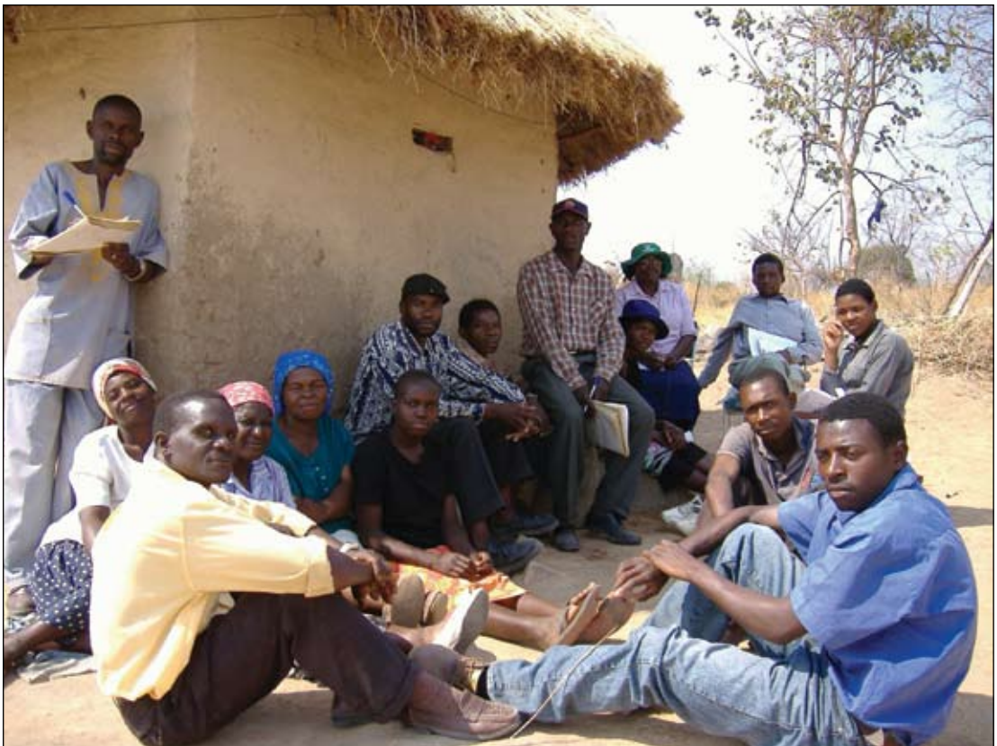
Meeting of a village Child Protection Committee (CPC)

UOC also facilitates child participation at an organizational and district level. It coordinates regular meetings of village Child Protection Committees in each of the 375 villages in its district. UOC ensures that these committees include representatives from all stakeholder groups—caregivers, non-governmental organizations, the police, government ministries, and, significantly, children and/or youth. UOC fosters child participation in village CPCs by giving children and youth the tools they need to elect their representatives. Before elections are held, UOC holds “ Role Model Workshops ” which provide children with information on child rights, the role of the child representatives, and the types of issues that CPCs address. In this way,