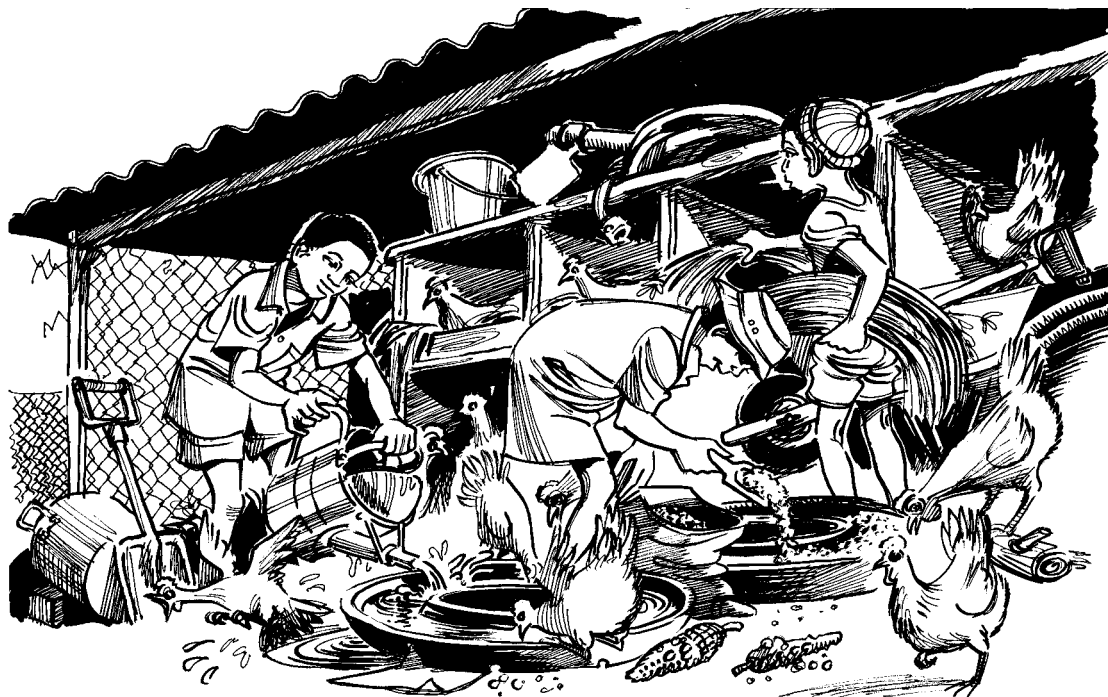
Junior Farmers conduct an experiment to find the best production system.