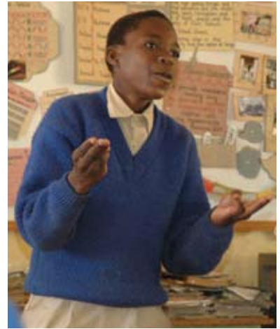
Hearing impaired student supported by Nzeve at Elim School.

students. These Day Events are opportunities for Nzeve to talk with students about issues of concern to them, including HIV/AIDS, child sexual abuse, growing up, friendship, health and staying fit. Reaching this target group with accurate, practical information is critical because studies suggest that the hearing-impaired population in Zimbabwe has elevated rates of HIV infection. Nzeve uses the Auntie Stella pack for its SRH education program, a collection of activity cards produced by the Training and Research Support Centre that facilitate discussions among young Zimbabweans on sex, life and relationships. CRS/Zimbabwe provided all of its STRIVE partners with Auntie Stella materials and facilitated staff members' training in how to use the pack with children.