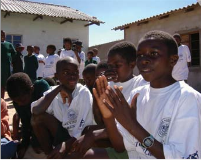
Members of a child-led internal savings and lending group supported by RUDO (a CRS-Zimbabwe partner) discuss their group's plans.