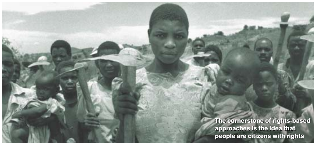
The cornerstone of rights-based approaches is the idea that people are citizens with rights

International development agencies are increasingly using rights-based language. But how can their policy and practice support people's own efforts to turn their rights into reality?